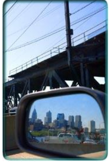
Hindsight is 20/20: Philadelphia's great potential will remain just that without solid planning.